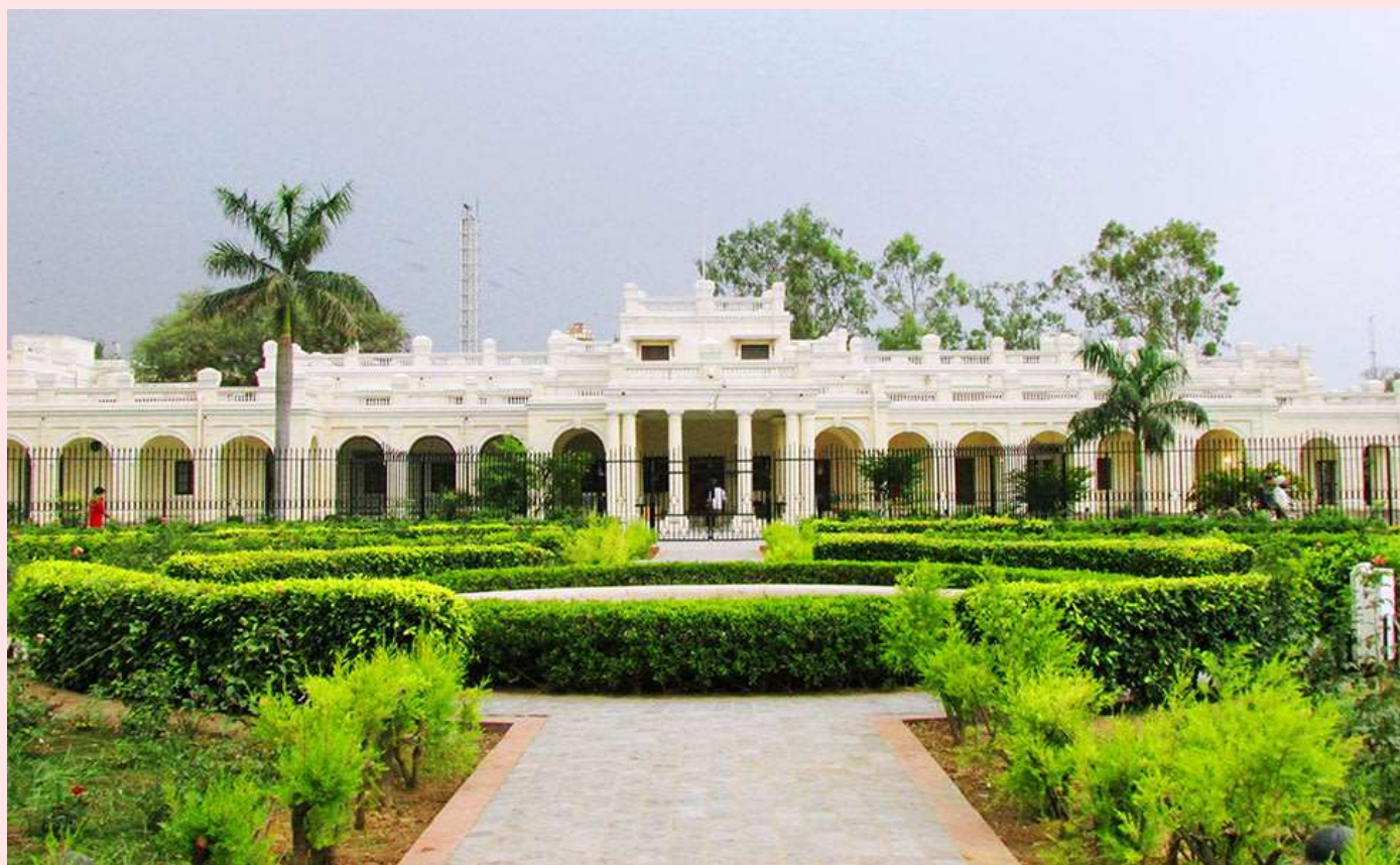
Vice Regal Lodge